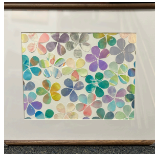
CCS STUDENT-MADE ART PIECES