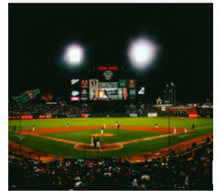
UVA VS. MIAMI FIRST PITCH & TICKETS