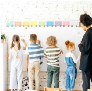
CCS TEACHER EXCLUSIVES