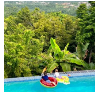
JAMAICAN VACATION FOR UP TO 18

Can't attend, but want to bid on Live Auction items? Proxy Tickets are available for $75 - click the link to learn more!