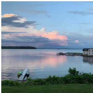
LAKE CHAMPLAIN HOUSE AND BEACH

CHCEK OUT THE AMAZING LINEUP OF AUCTION ITEMS!